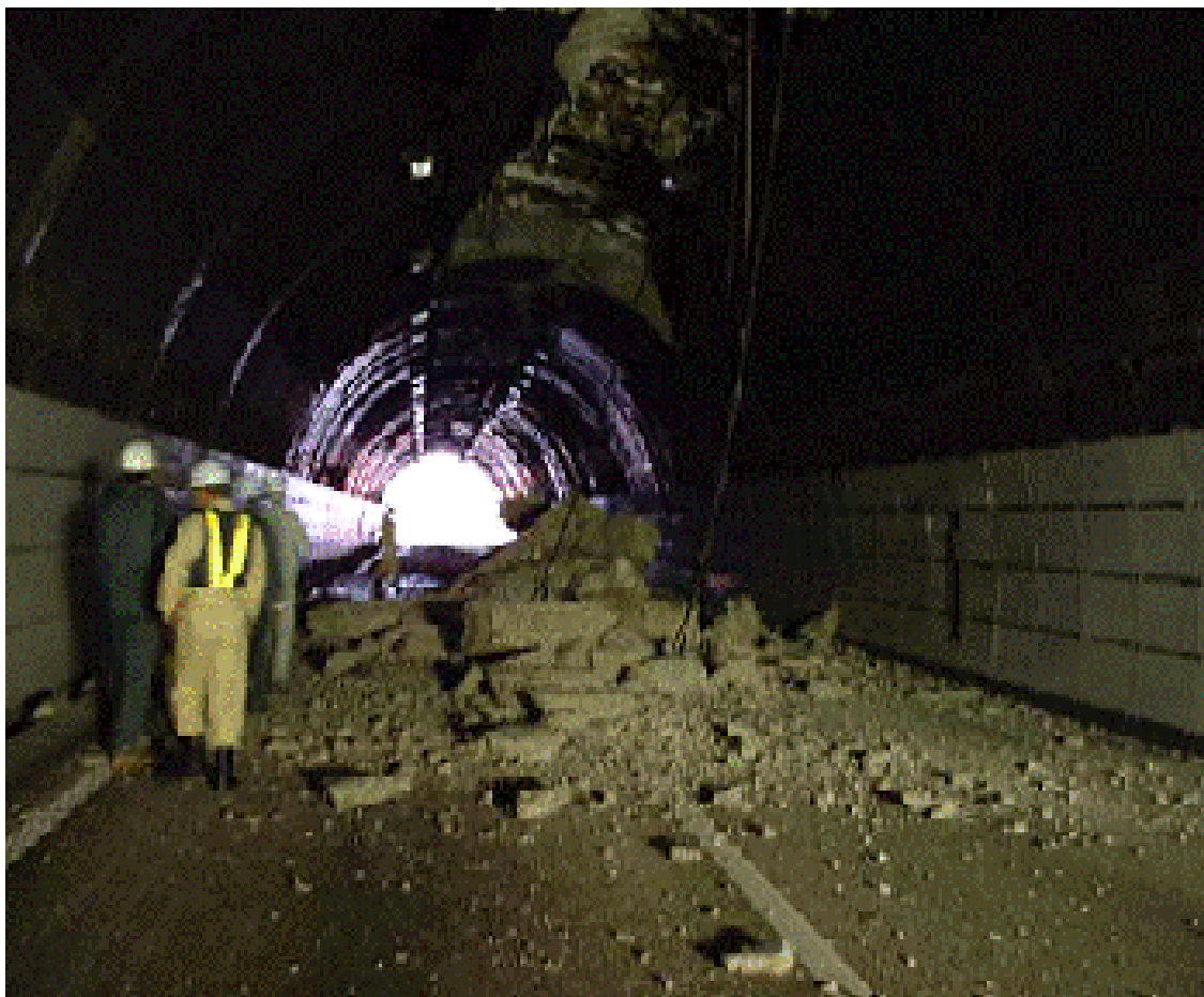
Figure 2.7 – Earthquake damage to tunnels.

Depending upon the event, the tunnel may need to be closed until earthquake aftershocks have diminished. It is also advised to be aware of tsunamis in low lying areas after a seismic event. As with other emergency events, service should be restored safely and as quickly as possible, following a thorough safety inspection.