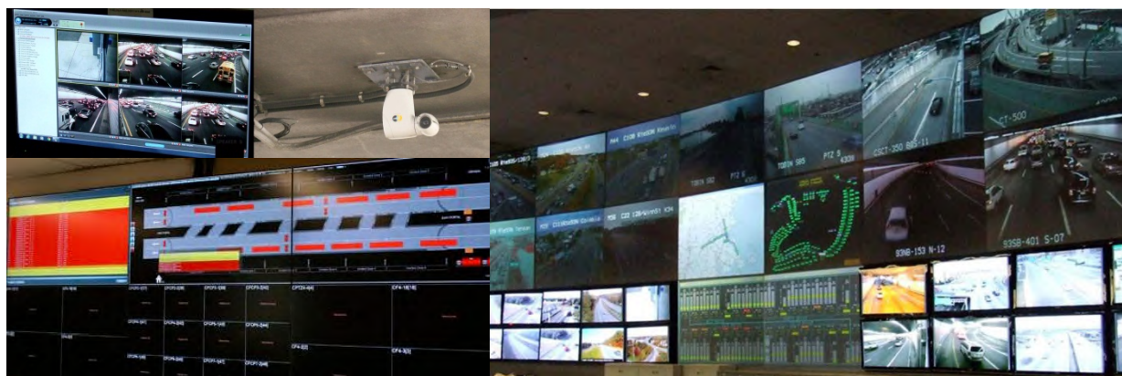
Figure 2.4 – Incident detection systems facilitate a rapid response to the emergency.