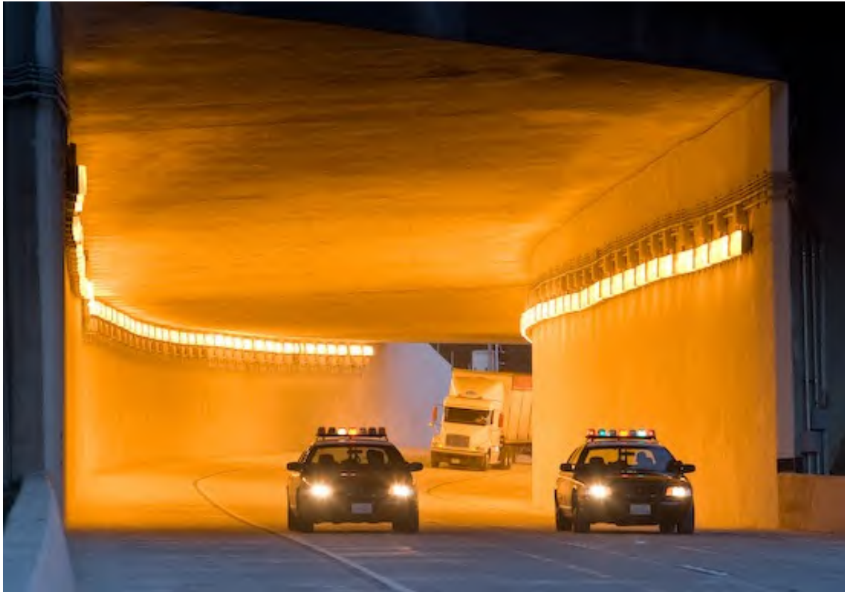
Figure 2.8 – Police escort through tunnel to mitigate safety concerns.

Quantitative methods can be used to evaluate security risk to tunnels that include threats, vulnerabilities, and consequences. One method developed for the Transportation Security Administration by the US Army Corps of Engineers ( See Appendix A ) evaluates risk in two distinct areas: Operational Risk and Casualty Risk. This is a component-level methodology that evaluates mitigated and unmitigated threats. The tunnel owner can evaluate the effectiveness of strategies to minimize damage, limit loss of life and function, and allocate resources. The Operational risk analysis allows an owner to select an “Operational Loss of Service” damage level and then evaluate the current and mitigated threat sizes relative to the specified damage level. The Casualties Risk Analysis uses a scenario-based procedure to select a threat size and location. From this information, the current and mitigated casualties are evaluated. This risk process is used for new and existing designs to develop mitigation strategies and to effectively reduce costs. By using the quantitative risk assessment, the multi-hazard concept of operations can be developed.