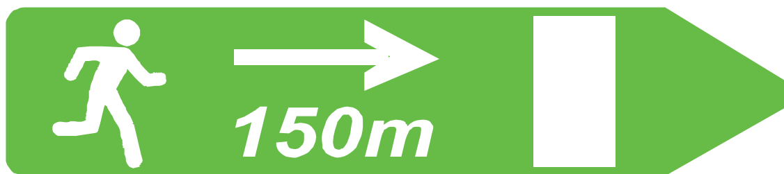
Figure 2.9 – Proposed sign for emergency escape route.

A current study is underway at the National Cooperative Highway Research Program to evaluate signs, markings and auditory messages in order to develop guidelines for use in the United States. An example of the type of sign that is under consideration is shown in Figure 2.9.