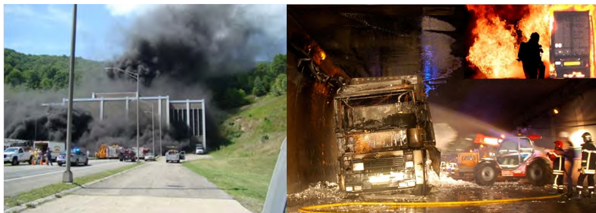
Figure 2.3 – Tunnel fires can be extremely dangerous.

Tunnel fires can be very difficult to extinguish; and these fires can produce large amounts of toxic smoke and dangerous heat that can fill the tunnel (See Figure 2.3). The tunnel operator has a responsibility to protect the tunnel occupants. Rapid detection is essential in this safety chain, and surveillance equipment, fire and smoke detectors, and Supervisory Control and Data Acquisition SCADA systems play a major role in the rapid detection of fires (See Figure 2.4). Modern tunnel facilities are protected by fire extinguishers, sprinkler systems, and deluge systems (See Figure 2.5).