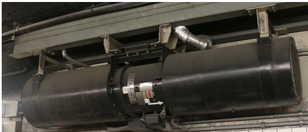
Figure 2.2 – Emergency ventilation fan.

Fire incidents often require emergency ventilation measures to exhaust the smoke, control superheated gasses, and provide tenable escape routes (See Figure 2.2). There are a number of ventilation concerns during a fire such as back-layering of smoke, fueling oxygen to the fire, exhausting superheated gasses, pressurizing escape routes to repel smoke and superheated gasses. In order to minimize potential ventilation errors during a fire event, written guidelines should be established for the operation of the mechanical ventilation system for various scenarios.