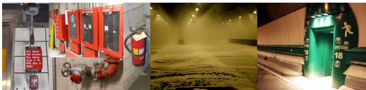
Figure 2.5 – Fire protection equipment and accessible escape routes.

Fire support personnel and other first responders should be notified immediately; however, emergency responders may not always arrive at the scene in time to assist with the evacuation. In the period before the emergency responders arrive on the scene, self-rescue should be encouraged. The vehicles in front of the accident site should be directed to exit out of the tunnel in the direction of travel. The tunnel occupants trapped behind the fire and debris generally must evacuate on foot.