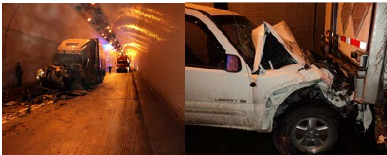
Figure 2.1 – Collisions within tunnels.

Impact damage frequently occurs in tunnels from over-height vehicles near the portals. After an impact incident, traffic should be stopped at the tunnel entrance until the situation can be sufficiently assessed. If there are any injuries, emergency personnel should be immediately notified. Once the conditions are rendered safe by removing abandoned vehicles, removing damaged vehicles, clearing debris, repairing pavement, and inspecting for damage to the tunnel, the tunnel can be restored to service (See Figure 2.1).